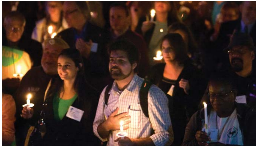
Hundreds of attendees converge on Albuquerque's Civic Plaza for a candlelight vigil to commemorate and stand in solidarity with individuals currently and formerly incarcerated for drug law violations.

The conference generated a flurry of positive media coverage in outlets such as the Associated Press, Washington Post , Vancouver Sun , Albuquerque Journal , and The Economist .