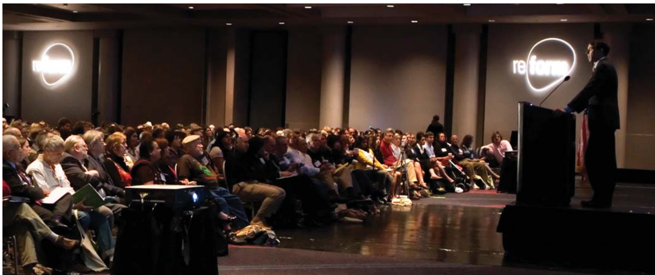
Above: El Paso City Council member Beto O'Rourke welcomes attendees at the opening plenary.

The conference focused on the rapidly changing political climate and forward-thinking issues, such as systems for marijuana regulation, supervised injection sites in the U.S., and shifting drug use from a criminal justice to a health issue. It also reflected the diversity of our growing movement. There were more people from outside